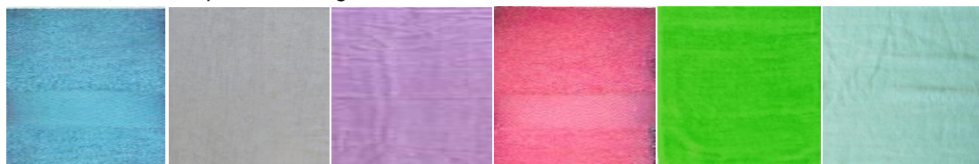
turquoise cool grey lavender hot pink lime green mint

*Dave Seehafer, 949-466-4110, INFO@GLOBALWAVEVENTURES.COM to put more $$$ in your pocket*